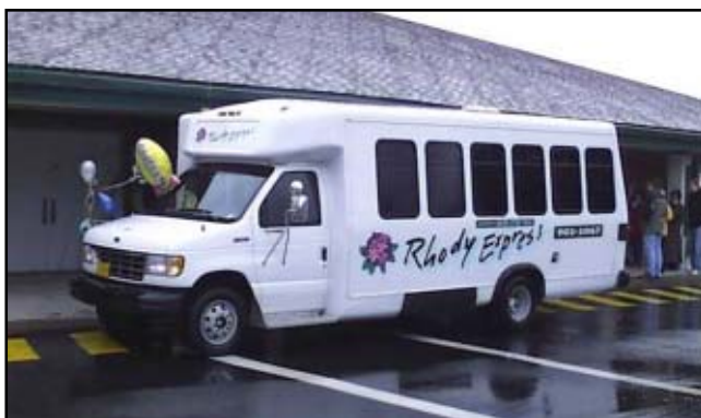
Rhody Express will offer extended service starting July 1.