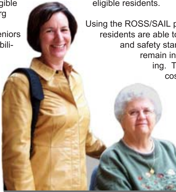
Senior & Disabled Services helps Lindeborg Place residents benefit from the ROSS/SAIL program.