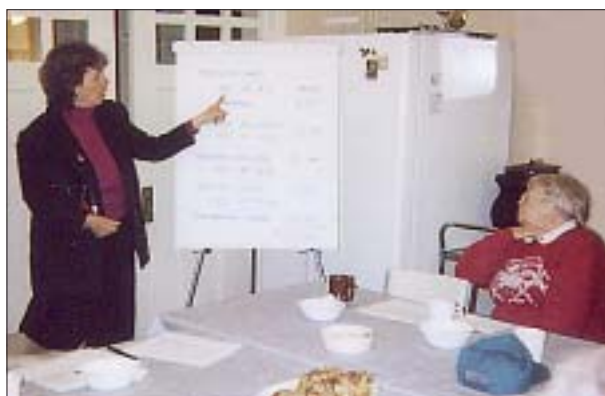
Lane Community College's Retired & Senior Volunteer Program has partnered with LCOG to operate the Lane County Family Caregiver Support Services Program.