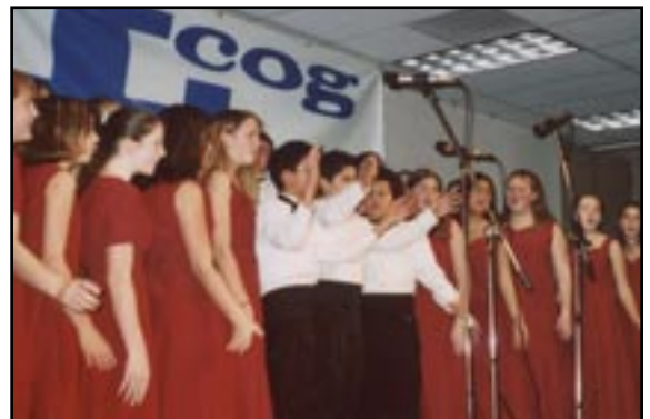
The "Shasta Session Jazz Choir" from Shasta Middle School performed.