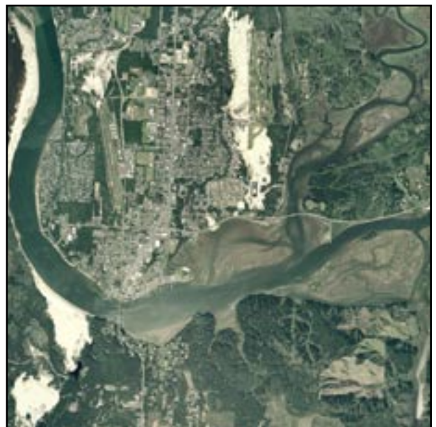
Florence and Highway 101 on the Siuslaw River